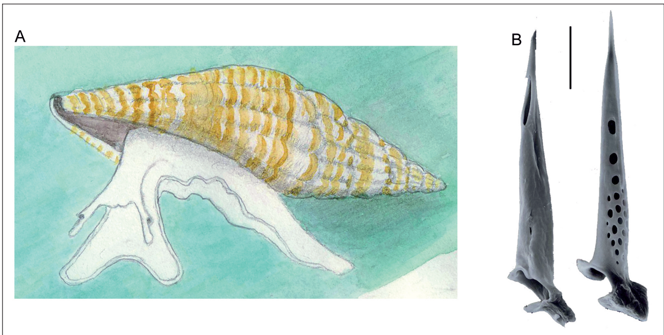
Fig. 2. A. Living mollusc, from Bruccoli (eastern Sicily) [drawing by GS]. B. Radular tooth, scale bar = 25 \mu\text{m} [SEM A. Warén]; specimen from Ceuta (Spain, northern African coast).

Shell spindle-shaped, 11 mm high, with 7 teleoconch whorls, decorated with axial costae – of which 8 on last whorl – of rounded section, with slight bend at suture insertion. Very thin spiral striae – in a few specimens alternating with a few in higher relief – in intervals between axial costae. Aperture elongate, narrow, hardly higher than half last whorl. Anterior canal relatively short, straight, sculptured with striae that are sparser, more oblique and more prominent than those between axial costae. C-shaped posterior sinus thickened by callosus extending over inside outer lip. Thick, wide varix outside rim of lip. Protoconch paucispiral (< 1.5 whorls), smooth apart from a few markedly arched axial folds, crossed by a series of very slender spiral striae, microsculpture marking passage to teleoconch. Background colour ranging from whitish to ivory, with spiral yellowish stripes that become denser on lower half of last